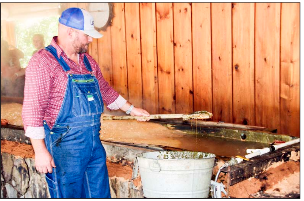
It takes a lot of hands minding the sorghum syrup pan down at the mill in Meeks.

and that folks needed to "get their butts out here! It's good local fun ... Do some shopping. Support local, shop local.